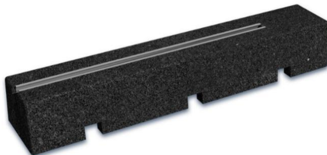
This image may slightly differ from the real product

Length and width: 600 × 120 mm Thickness (height): 90 mm