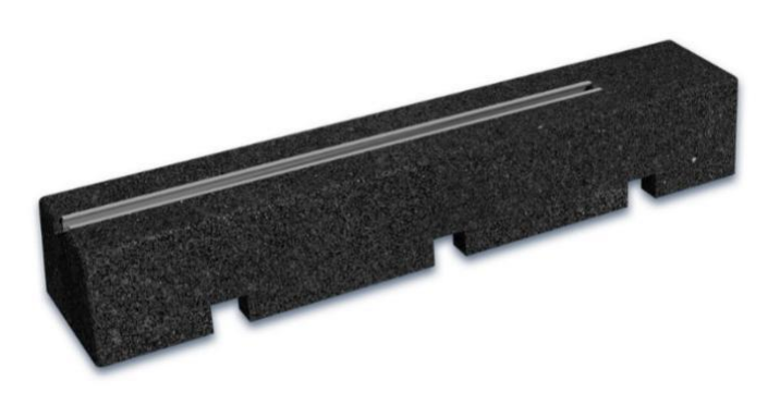
This image may slightly differ from the real product